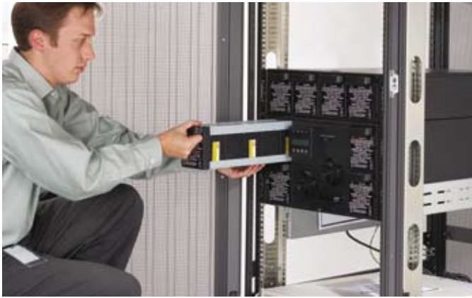
Modular, lightweight design allows for easy installation and service