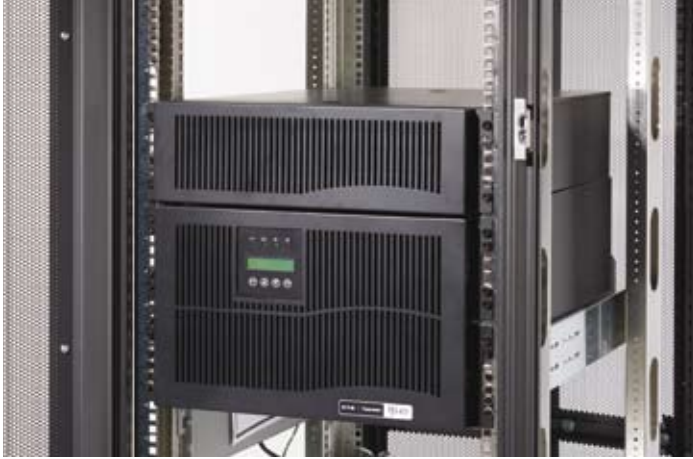
The Powerware 9140 UPS and one EBM occupy only 9U of rack space.