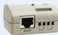
Environmental Monitoring Probe

Independently manage diverse servers. A Multi-server Card enables up to six serially connected devices of mixed operating systems to be independently managed and controlled by a single UPS.