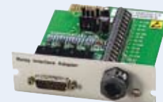
Relay Interface Card

Interwork with you existing Building Management System. A Modbus® Card enables real-time monitoring of UPS systems through a Building Management System or Industrial Automation System.