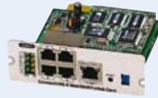
ConnectUPS Web/SNMP Card

The standard unit is equipped with USB and RS-232 serial ports to communicate with power management software. You can customise your UPS by adding an interface card for other applications: