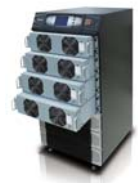
Scalable and Hot-swappable