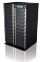
100-120 kVA + Battery Cabinet